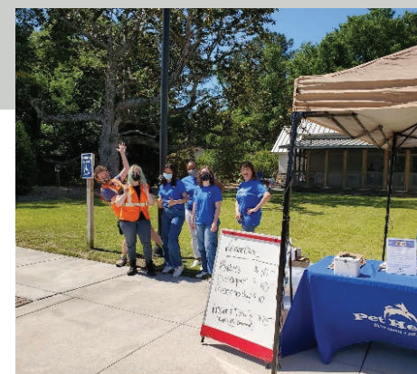
Pets need their vaccines too! Contact Pet Helpers located at 1447 Folly Road.

Did you know that your risk of death or hospitalization drops to nearly zero once you've been vaccinated? Get the facts at scdhec.gov/vaxfacts . To find a COVID-19 Vaccine location near you: Search https://vaxlocator.dhec.sc.gov , text your ZIP code to 438829, or call 1-866-365-8110