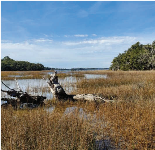
James Island Creek Basin

In addition to the American Rescue Funds the Town will have available for new infrastructure, the Fiscal Year 2021/ 2022 budget already included a little over $2.1 million dollars for new projects.